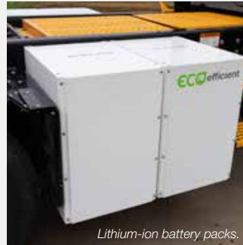
Lithium-ion battery packs.

Instead of accessories consuming power even when they are not in operation, ours will only use power when they are needed. Making sure that your power wastage is minimised and your batteries last longer.