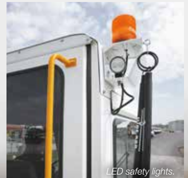
LED safety lights.