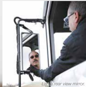
Large rear view mirror.