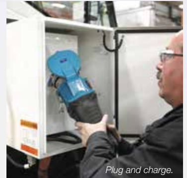
Plug and charge.